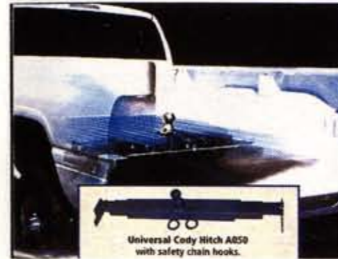
Universal Cody Hitch AO50 with safety chain hooks.

The "straight thru" design allows dirt and water to pass through, reducing freeze-up problems.