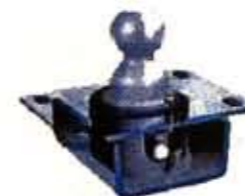
Flat Bed Hitch with Center Beam and Ball