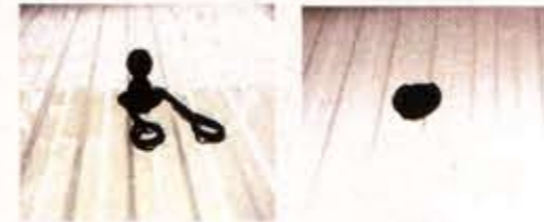
Ball up Ball down